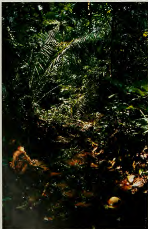
Fig. 6. Locality of Polythore spaeteri, spec. nov. (copula) in the rain forest of Panguana after first rain.